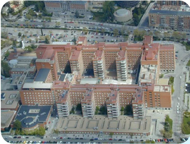
San Carlos Hospital in Madrid